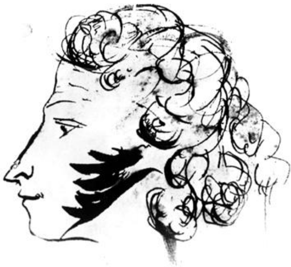
Pushkin self-portrait, 1826 (SCRSS Library)

One of the sadder aspects of the world of translation is that, along with the many bad translations, the few outstanding translations all too often end up out of print and forgotten. It is a joy to be able to reprint at least a dozen of Cornford's graceful translations of Pushkin, Lermontov, Tyutchev, Nekrasov and Blok.