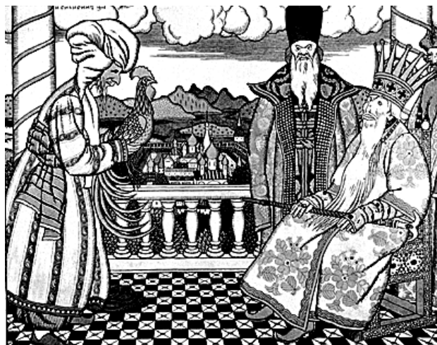
Illustration to Pushkin's The Tale of the Golden Cockerel by Ivan Bilibin, 1906

With the nineteenth century, almost all my choices were obvious ones: such masterpieces as The Queen of Spades and The Greatcoat clearly deserved their fame; there seemed no point in struggling to come up with more original choices. With the twentieth century, however, I ended up including several writers I had never even heard of beforehand. Joanne Turnbull sent me her translation of Sigizmund Krzhizhanovsky's brilliant Quadraturin only a few days before my final deadline; I at once dropped a translation of Chekhov to make room for it. And the émigré writer Nadezhda Teffi – another writer I had never heard of before – is a true heir to Chekhov, as wise and compassionate as she is witty.