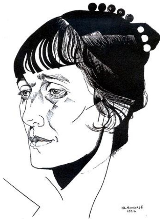
Ink drawing of Anna Akhmatova by Yuri Annenkov, 1921

Grimm). Both these books have long been out of print, so I was delighted when Penguin Classics agreed, after good reviews of the short story anthology, to commission me to compile a collection of Russian magic tales. Pushkin was one of the first Russian writers to take a serious interest in Russian folklore, so I knew at once that the book should begin with Pushkin, that it should include Afanasyev and that it should end with my translations of Platonov's skazki . There has always been a lot of interplay in Russia between high culture and folk culture, so it seemed right to include both genuine folk tales and literary re-tellings. As well as Pushkin and Platonov, I chose to include Pavel Bazhov, who has been hugely popular in Russia throughout the last seventy years. These three, I believe, are the only Russian writers who have truly entered into the heart of the folk tradition and then created afresh from within it. I have also included several stories of a somewhat different kind by Teffi, who retained a deep interest in Russian folklore throughout her life. Russian Magic Tales from Pushkin to Platonov will be published this December.