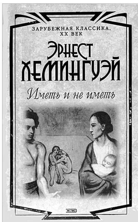
Cover of Soviet edition of Ernest Hemingway's To Have and Have Not

for a great number of canonical Russian and Soviet writers. As political pressure in the 1930s increased and it became more difficult to publish works that were not textbook examples of Socialist Realism, writers such as Anna Akhmatova, Boris Pasternak, Evgenii Zamiatin and Mikhail Zoshchenko found refuge in translation: it provided them with a means to earn a living and an official occupation.