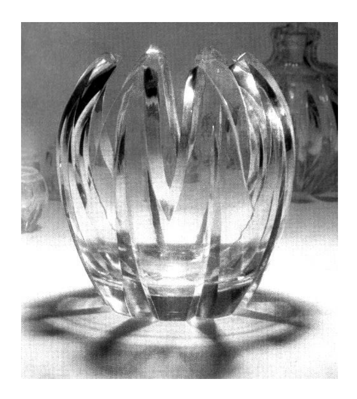
Photograph from Vera Ignat'yevna Mukhina by Raisa Abolina ( SCRSS Library )

The SCRSS Art Library is a wonderful repository of extraordinarily rare items. However, despite the care taken by SCRSS staff and volunteers, this unique collection now operates at or beyond its spatial limits and some books, many of them with beautiful dust-jackets, show signs of wear and tear. New donations, some from bequests, occasionally arrive, and there comes a point when a whole shelf-load needs to be shifted along. A strategic look at the use of space is now overdue.