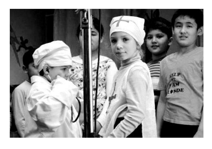
Children of St Petersburg group during filming

methodological light was not petrified theory, but the questioning eyes of our children!