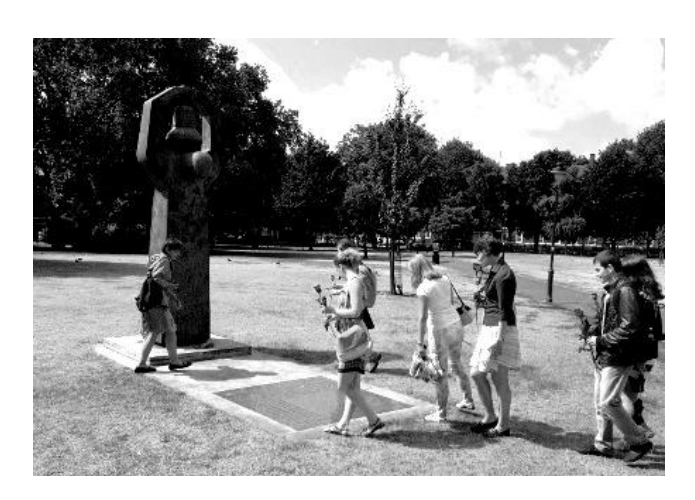
St Petersburg student group, hosted by the SCRSS, laying flowers at the Soviet War Memorial, July 2013

www.rusemb.org.uk/article/223 for the full text. For photographs and audio of all the speeches, see local community news website London SE1 at www.londonse1.co.uk/news/view/6809.