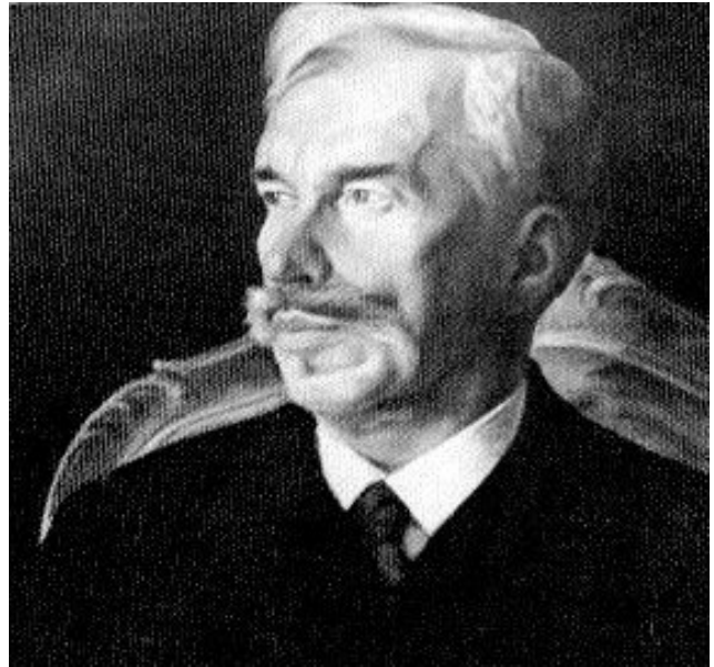
Sergei Shchukin

others. For many, such encounters with Russian art – still far too little known in the West – will come as a welcome discovery.