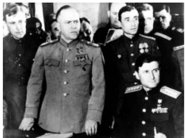
Marshal Zhukov, Berlin, 1945