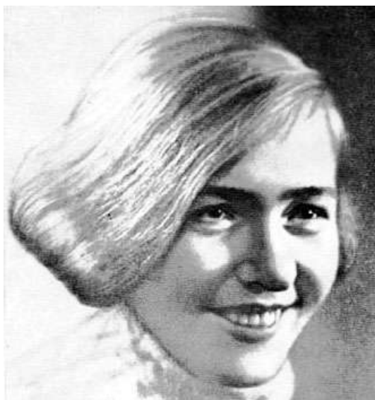
Olga Berggolts, 1941

about this picture of Russian poetry being represented by two men and two women – two from Moscow and two from St Petersburg; two who survived the Stalin era and two who died young – but this should not lead us to think that they are the only poets worth listening to.