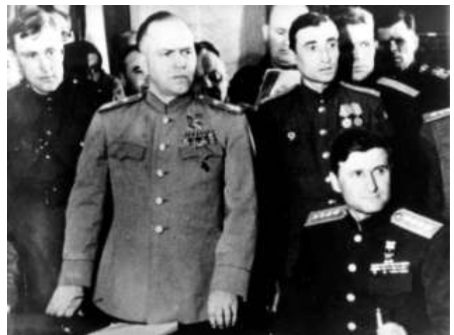
Marshal Zhukov, Berlin, 1945