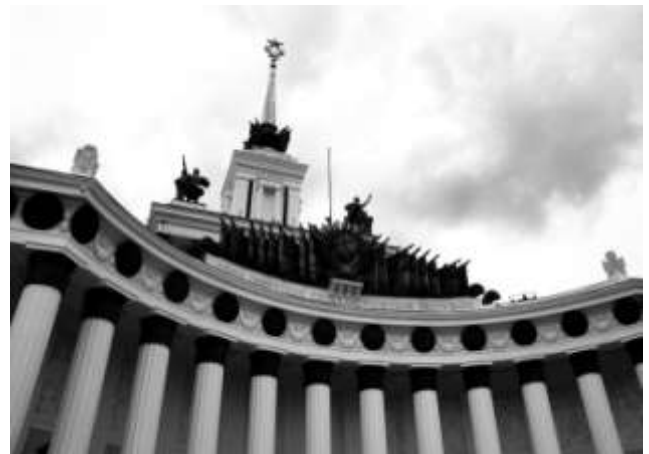
ВДНХ, USSR Exhibition of National Economic Achievements, Moscow

military force and political coercion. The notion of 'soft power' utilised by American academics / political advisers, such as Joseph Nye, is both descriptive and prescriptive; not only does it describe Western values and ways of doing things but concurrently it claims that other people should adopt them.