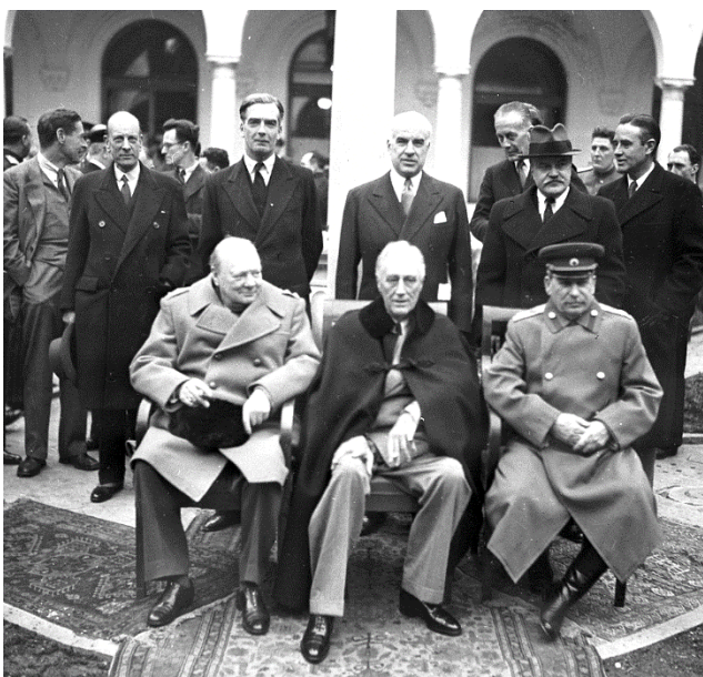
Yalta Conference, 1945: Churchill, Roosevelt and Stalin seated, with Eden, Stettinius and Molotov standing behind

bitter history of ideological conflict between Soviet Communism and Western liberal democracy. Within Western states there were anti-communists hostile to alliance with an ideological enemy, while on the Soviet side there were deep suspicions of Western capitalist leaders, not least of Churchill, who had tried to strangle Bolshevism at birth by massive military intervention in the Russian Civil War. The Grand Alliance also had to deal with Hitler's efforts to sow seeds of doubt by spreading rumours that each of the allies was negotiating a separate peace with the Germans.