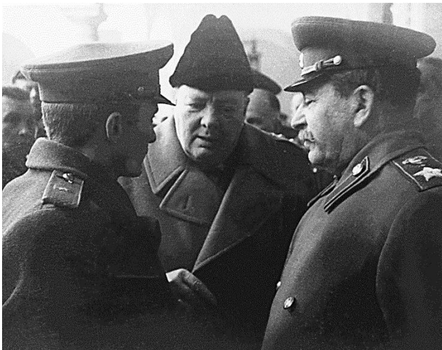
Conversation between Churchill and Stalin at the Yalta Conference, 1945

them or represented them in the most important and intimate negotiations. Vyacheslav Molotov, Stalin's Commissar for Foreign Affairs, drafted his correspondence with Churchill and Roosevelt, carried out important diplomatic missions at home and abroad, and acted as his deputy in face-to-face negotiations with the British and Americans. Harry Hopkins was President Roosevelt's chief diplomatic advisor and personal envoy. Important, too, was Averell Harriman, Roosevelt's Lend-Lease co-ordinator in London and his ambassador in Moscow from October 1943. Churchill liked to keep his own counsel and preferred personal diplomacy to that conducted via intermediaries. During the war he travelled more than 100,000 miles, meeting Roosevelt eleven times and Stalin twice, as well as taking part in tripartite summits at Tehran, Yalta and Potsdam. But it was Churchill's Foreign Secretary, Anthony Eden, who travelled to Moscow in December 1941 for the first wartime summit with Stalin and he attended most of Churchill's bilateral meetings with Stalin and Molotov.